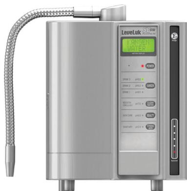
Plate Surface Area: 490 sq. in.